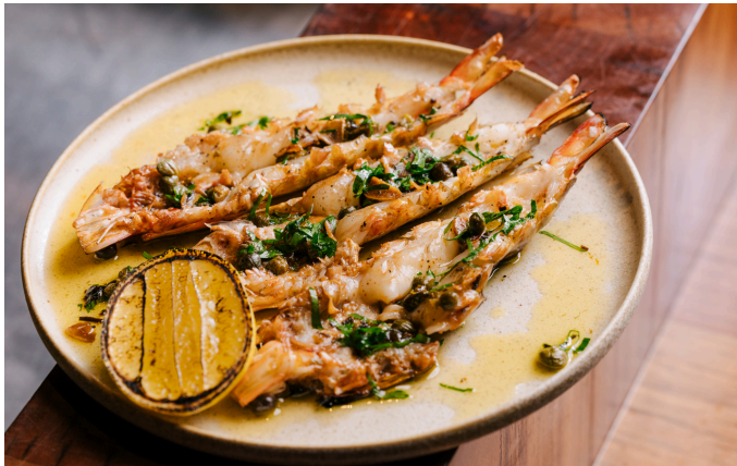
Pictured: King Prawn